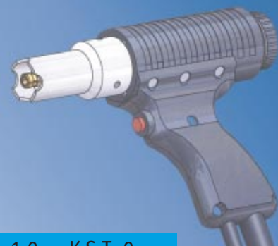
STUD WELDING UNITS KST 10, KST 9